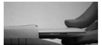
Sleek and slim MacBook Air

The glossy 13.3 inch, wide screen LED backlit display is the same as the screen on regular MacBook. The maximum screen resolution is 1280 x 800 and the keyboard is full-size with crisp keys just like the ones on a regular laptop.