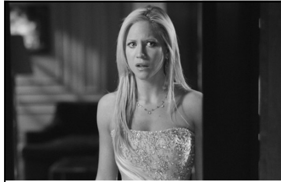
Brittany Snow takes the role of the main character, Donna, who's prom night is ruined by the return of her stalker.

The movie tells the story of a high school senior named Donna (played by Brittany Snow), who is barely recovering from being attacked by her deranged stalker. The antagonist, Richard Fenton (played by Johnathon Schaech), is an obsessive high school teacher who was put away for his romantically induced violent behavior towards Donna, who used to be one of his students. He manages to escape a high security mental asylum just in